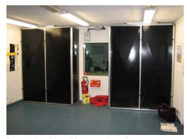
Former design of the wall (other manufacturer)