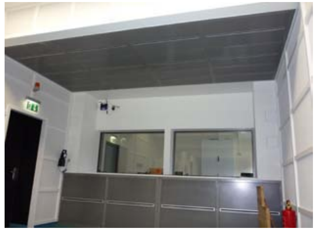
Indoor firing range with air distribution through ceiling and wall