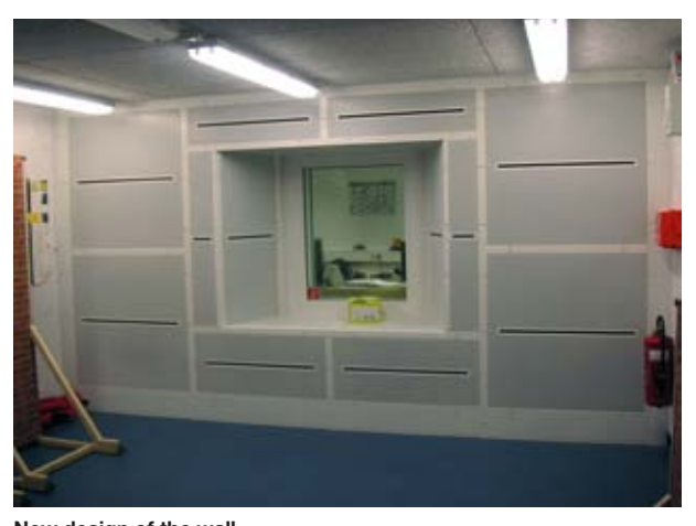
New design of the wall Make Krantz Components with improved indoor air velocity and flow direction