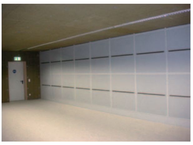
Air distribution wall with perforated air discharge panels and linear slot diffusers