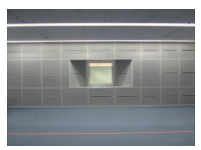
Air distribution wall with perforated discharge panels and linear slot diffusers

Window for the supervision of the shooter with air distributing embrasures