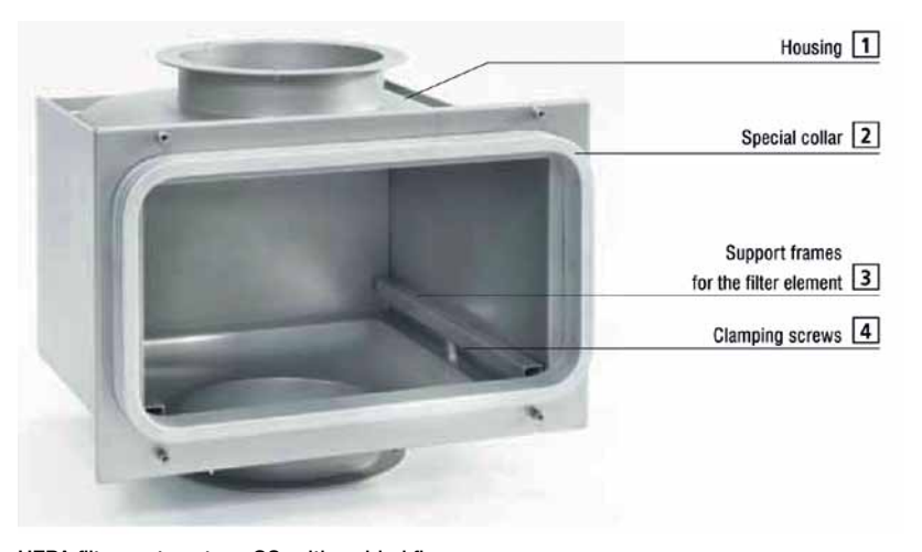
HEPA filter system, type GS, with welded flange (option on request)