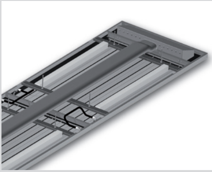
Multifunction sail AVACS